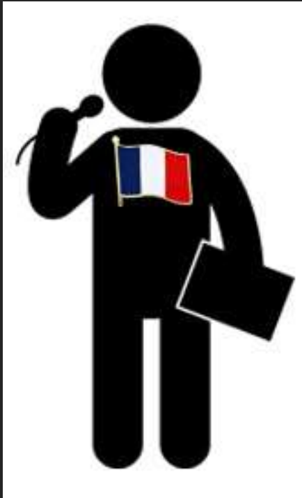
Speaking in Tongues