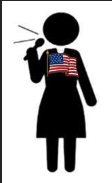
with the Interpretation of Tongues